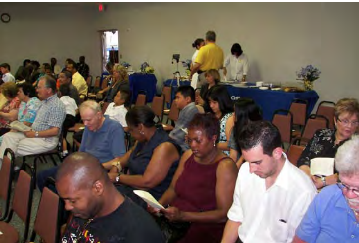
LOTS of family members watch the ceremony.