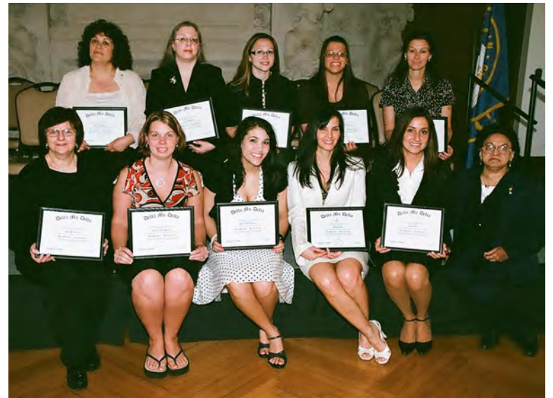
New student members of Delta Pi with their membership certificates.