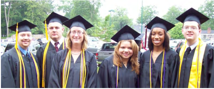
Graduating members of Zeta Pi

from bulletin boards to the college catalog, through campus periodicals and include the LaGrange Daily News. Students wear the Delta Mu Delta pins to increase the chapter's visibility. The chapter promotes itself electronically with a Facebook page and including its activities in the online weekly newsletter of campus activities.