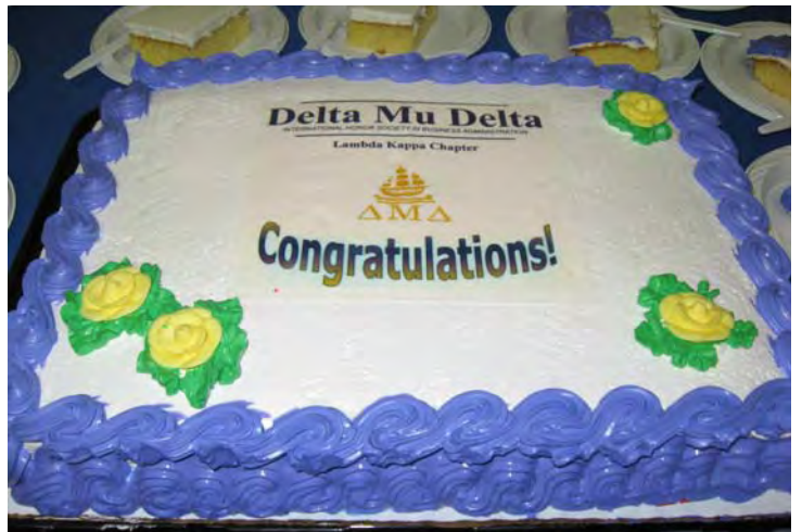
This cake takes the cake!