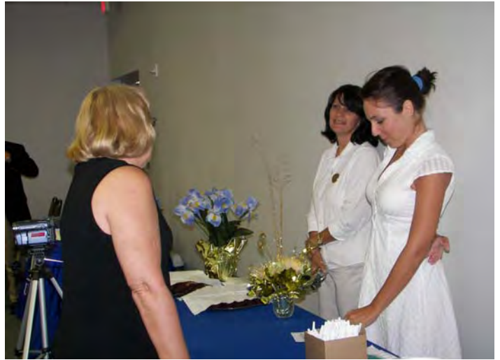
The Registration Table is Decorated and “Peopled”