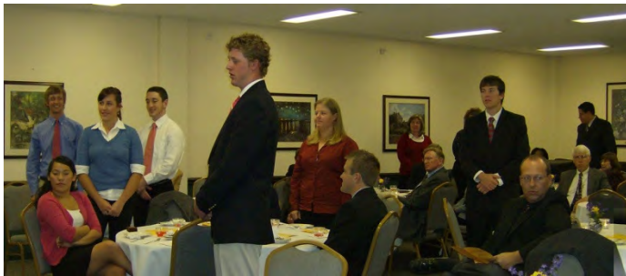
Candidates for the Eta Sigma Chapter of Methodist University stand as they are about to receive the symbols of membership.

How do you get all of the students invited to Delta Mu Delta to accept? The Eta Sigma Chapter of Delta Mu Delta at Methodist University knows the secret. The chapter achieved a 100% acceptance rate for both the fall 2008 and spring 2009 semesters, and they are willing to share how they did it.