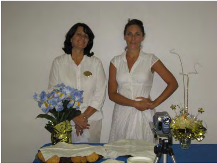
Cookies for Later