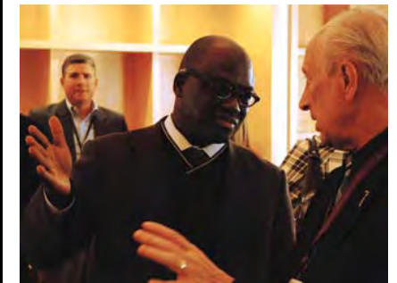
Which involves lots of hand signals!