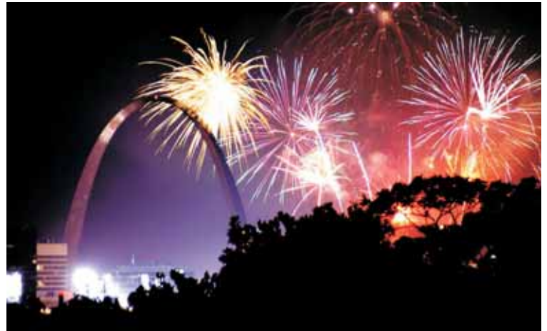
St. Louis Arch & Fireworks

http://www.explorestlouis.com/visitors/index.asp http://www.stlouisunionstation.com/info/aboutus.cfm http://www.metrostlouis.org/MetroLink/stationlist.asp